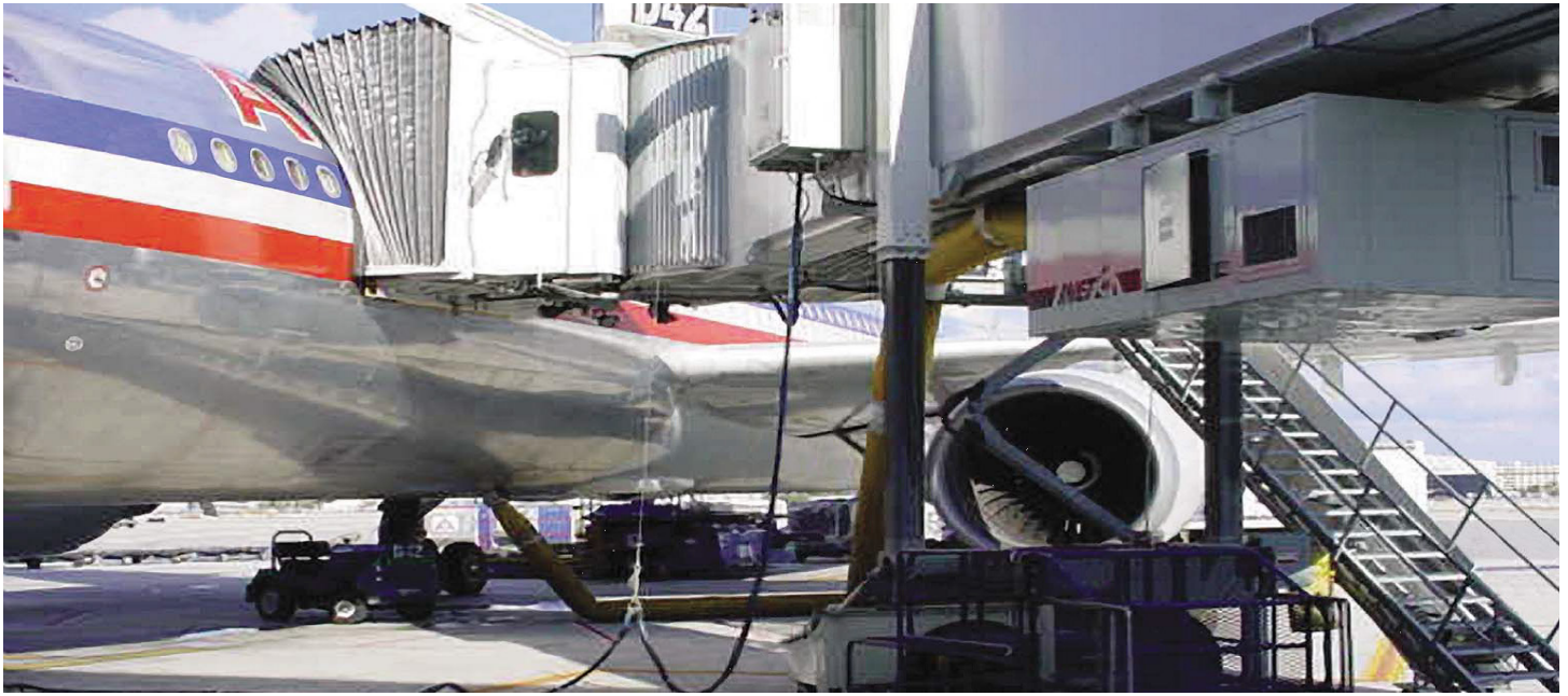
The ground-based aircraft cooling system delivers -3°C (26°F) air directly to aircraft A/C manifolds.