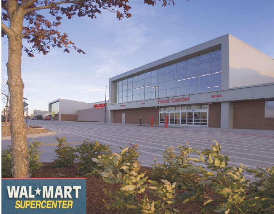
The Wal-Mart Supercenter in Aurora, Colorado, evaluates the latest green technologies in actual retail operations.