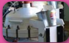
Oilfield Water Infrastructure Provider

Increased recycled produced water to ~100% reliably and consistently with minimal maintenance.