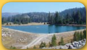
Bear Valley Water District Secondary Wastewater

Reduced turbidity up to 70% and at half the cost of Dissolved Air Flotation.