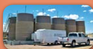
Oil & Gas Exploration Co. Produced Water

Outperformed other technologies while retaining 99.5% water recovery.