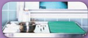
Iraqi Hospitals Wastewater Treatment

Compact design reduced footprint by 50% while helping meet discharge regulations.