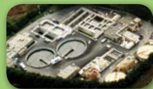
Sewer Authority Wastewater Treatment

Delivered stable filtrate to ultrafiltration with Zero fouling and backwash.