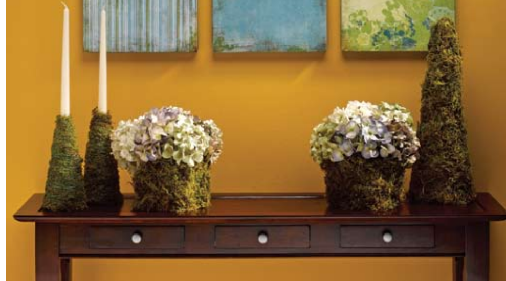
Note: Candles are for decorative purposes only.