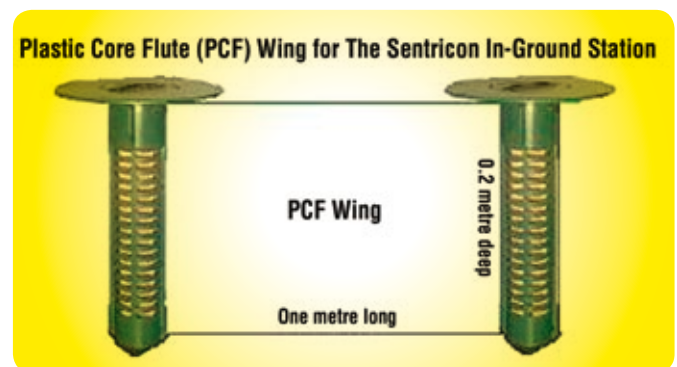
Diagram 1: PCF Wing placed between two IG stations.

Additional external MDs around the IG station has been shown to improve the performance of the PCF wing as they provide extra food for the termites helping to establish the station as a preferred feeding site, as well it reduces the risk of station abandonment. Once you bait one IG station always bait the IG station at the other end of the PCF wing as termites are likely to encounter that station too.