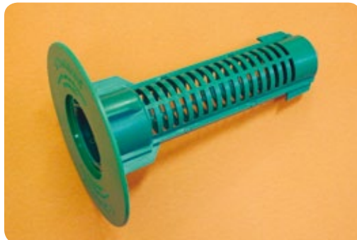
Sentricon In-Ground Station - comprising of: